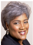
DONNA BRAZILE Renowned Political Strategist and Commentator