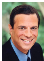
MICHAEL BESCHLOSS Nation's Leading Presidential Historian and Best-Selling Author

10:00 – Noon Coffee Break in Exhibit area